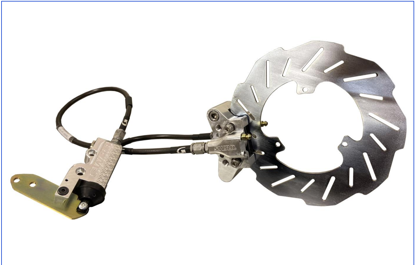
Photograph of the complete brake system

This Homologation Form reproduces descriptions, illustrations and dimensions of the brake system at the point of homologation. The Manufacturer may only modify these within the limits set by the Motorsport UK regulations in force and with the written agreement of Motorsport UK.