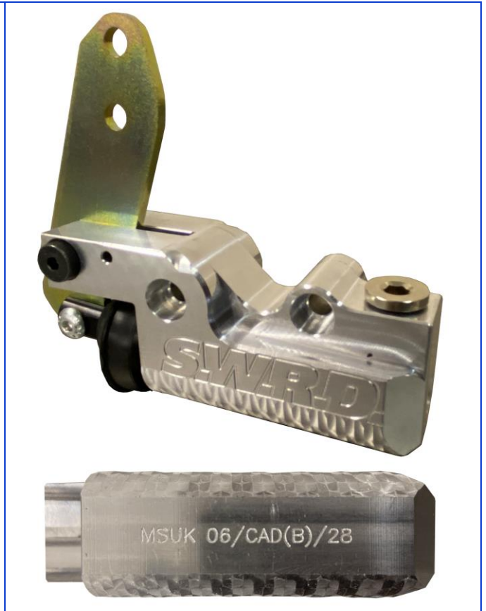
Photograph of master cylinder