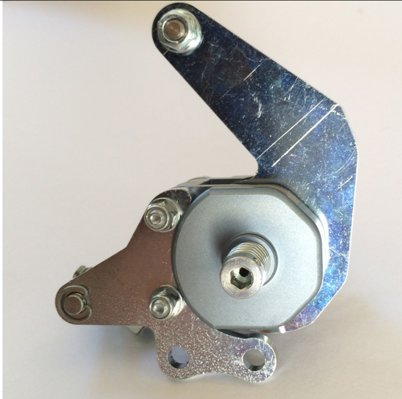
Photograph of brake caliper