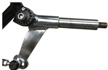
25mm Hollow Stub Axle 16 Position Multi-hole Camber/Caster System