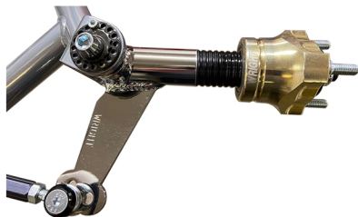
16 Position Multi-Hole Camber/Caster System With Upgraded 25mm Stub And Magnesium Hub.