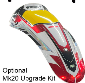
Optional Mk20 Upgrade Kit