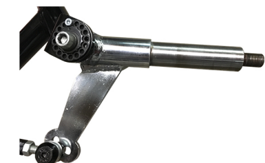
16 Position Multi-hole Camber/Caster System