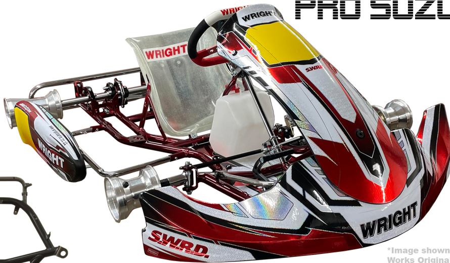
*Image shown with optional Works Original Graphics Kit