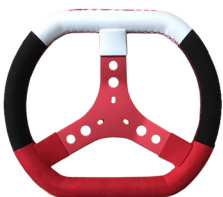
320mm F1 style SWRD steering wheel