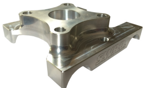
Full CNC Comer C50 Engine Mount