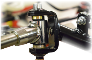
Adjustable 3 position front and rear ride height