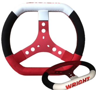
Wright F1 Steering Wheel