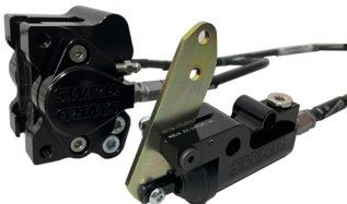
Hydra Super Light Hydraulic Brake System