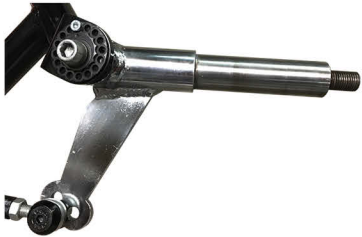
25mm Hollow Stub Axle 16 Position Multi-hole Camber/Caster System