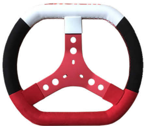
WRIGHT F1 Steering Wheel