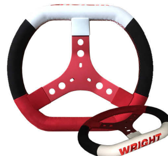
Wright F1 Steering Wheel