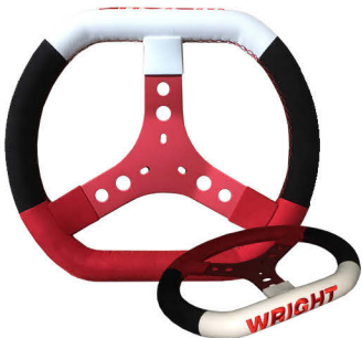
Wright F1 Steering Wheel