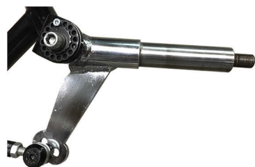
16 Position Multi-hole Camber/Caster System