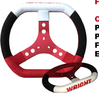
Wright F1 Steering Wheel